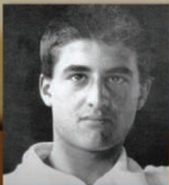
A relic of Blessed Pier Giorgio Frassati will be available for veneration.

Holy Family Church, 17 Fordham Avenue, Hicksville NY 11801 (516) 938-3846