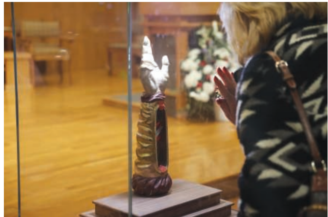
Photos from the November 30 th visit of St. Jude's Arm to Holy Family